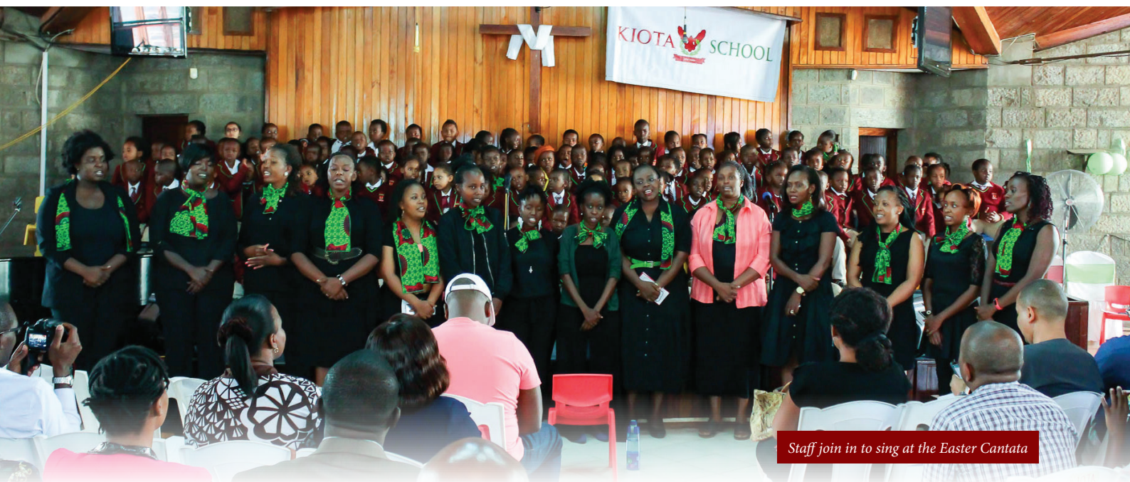
Staff join in to sing at the Easter Cantata

Dear parents, Our first term has come to an end. We have had a tremendously active and involving time in both Kindergarten as well as Primary. Indeed the children have shown an increase in proficiency in and out of class. This has been witnessed through their Academic work as reported by their teachers as well as in the co-curricular activities. We have had some exciting competitions such as the Primary Swimming Gala, Tae Kwon do tournament, Little Einsteins Science Fair as well as a Roller Skating championship in which our children participated in quite successfully and some came out having won medals. During this term there was also a very well attended and delightful Caregiver